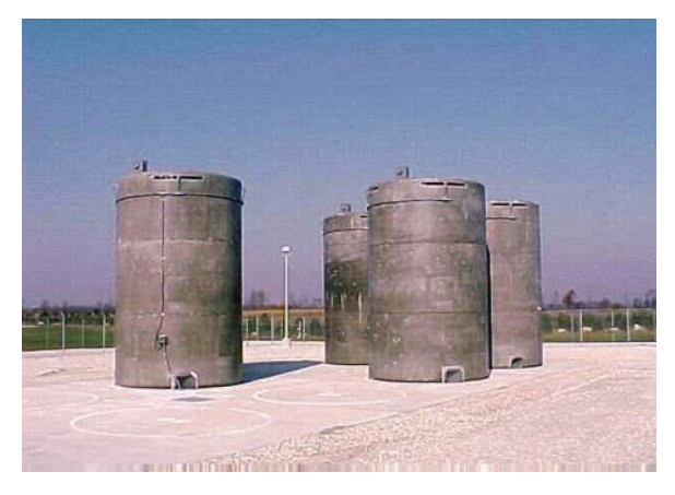
Dry Cask Storage of Spent Fuel

All U.S. nuclear power plants store spent nuclear fuel in "spent fuel pools." These pools are made of reinforced concrete several feet thick, with steel liners. The water is typically about 40 feet deep and serves both to shield the radiation and cool the rods.