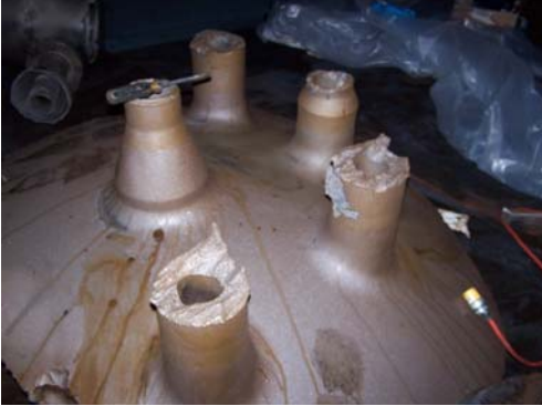
Upper Head after initial prep work