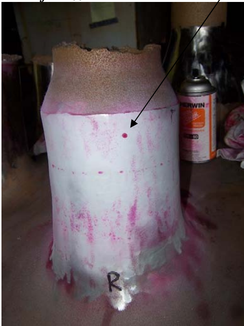
Relief Nozzle OD PT indication