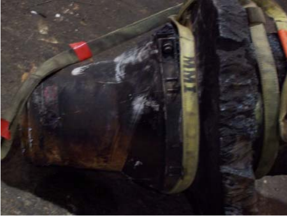
Lower head containing the Surge nozzle