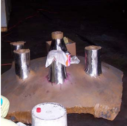
Upper head after flapping