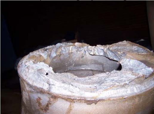
Portions of the end plug still in place