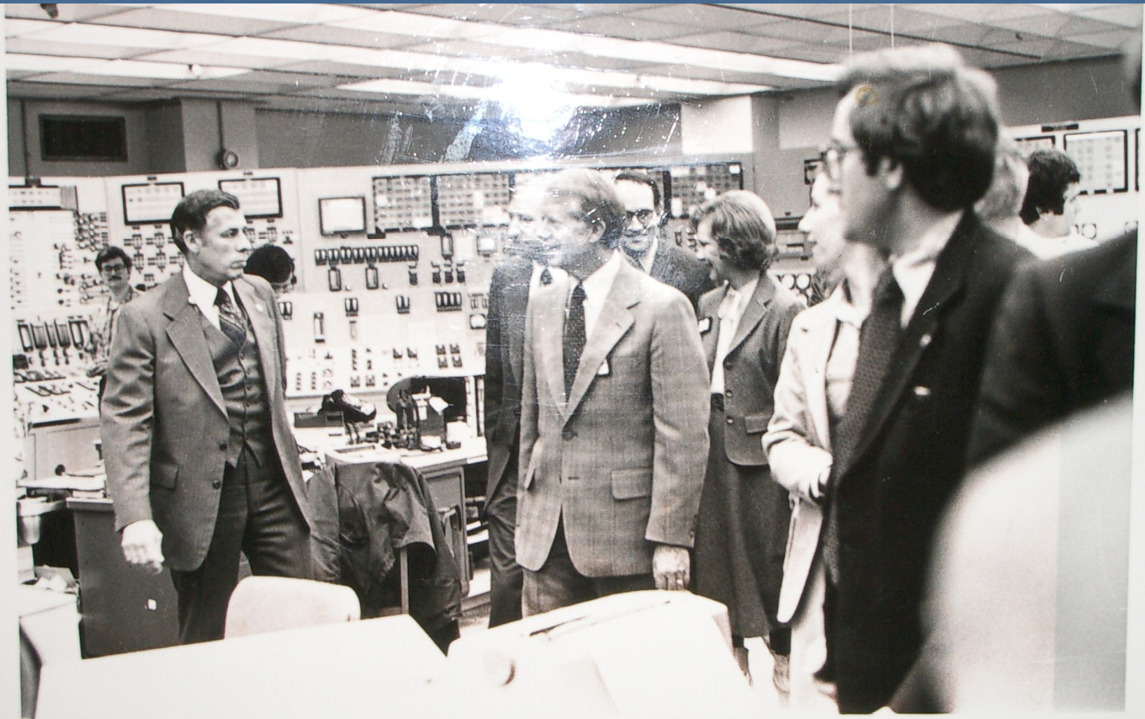
Jimmy & Rosalind Carter Visit 1 st April 1979