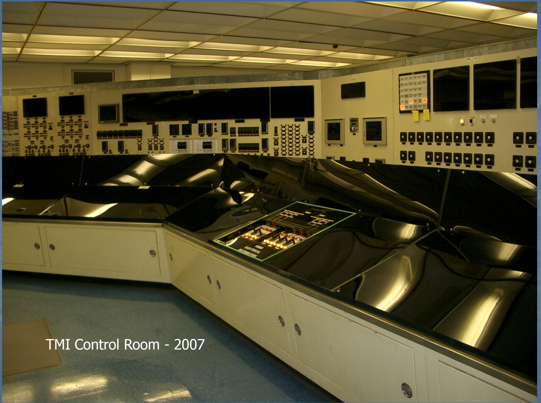
TMI Control Room - 2007