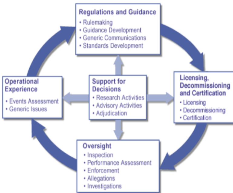
Figure 1: How NRC Regulates

The U.S. Nuclear Regulatory Commission (NRC) regulates the civilian uses of nuclear materials in the United States to protect public health and safety, the environment, and the common defense and security. The agency accomplishes this mission through: licensing of nuclear facilities and the possession, use, and disposal of nuclear materials; the development and implementation of requirements governing licensed activities; and inspection and enforcement activities to ensure compliance with these requirements.